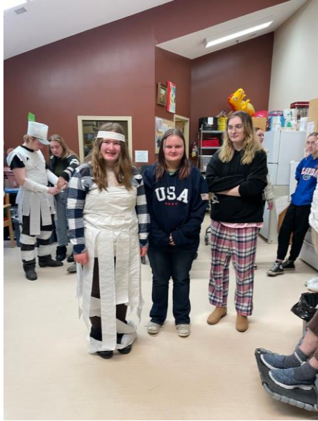
Students from the Lumsden High School treated the residents to a TP themed fashion show 😊